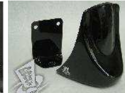
XL chin fairing