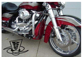
FL chin fairing